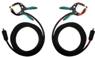
Current cables with TTA clamps