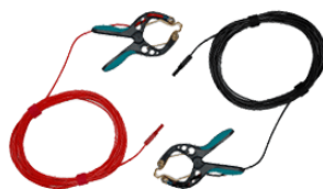
Voltage sense cables with TTA clamps