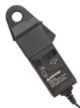
Current clamp 30 / 300 A + cable set 5 m