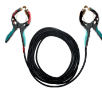
Current connection cable