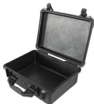
Cable plastic case